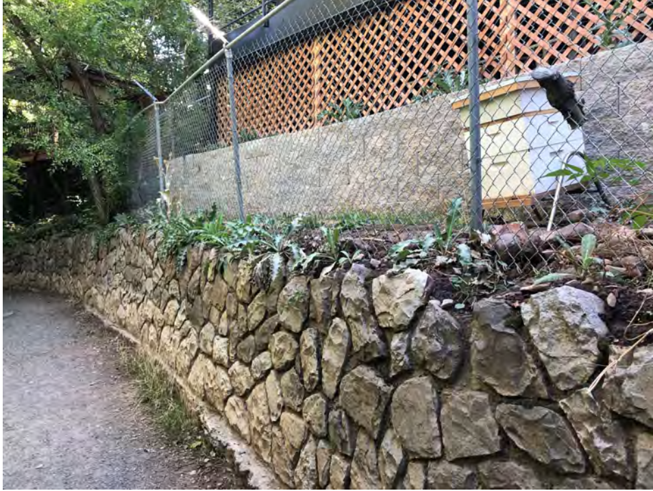
Photograph 13 - Area on the east side of creek where structures have been placed near the top of the wall. Also shown wall foundation exposed at the toe.