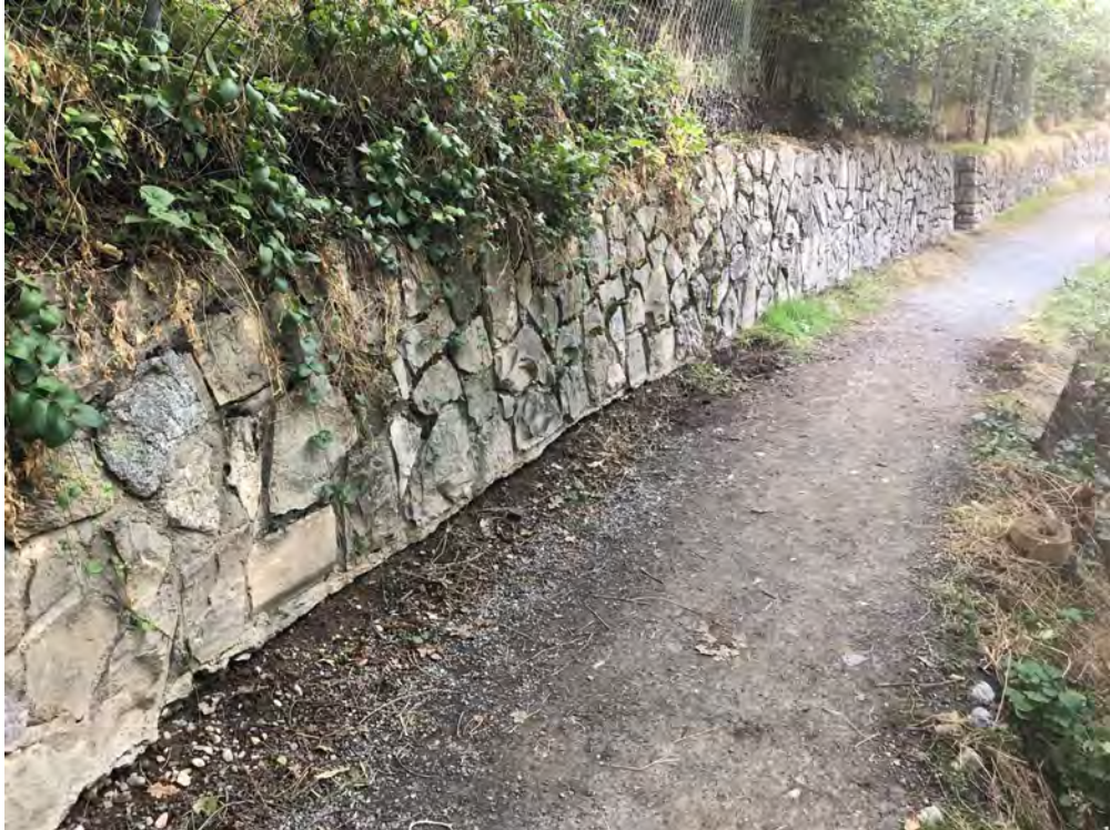
Photograph 6 - Ground at toe of wall appears lower than base rock.