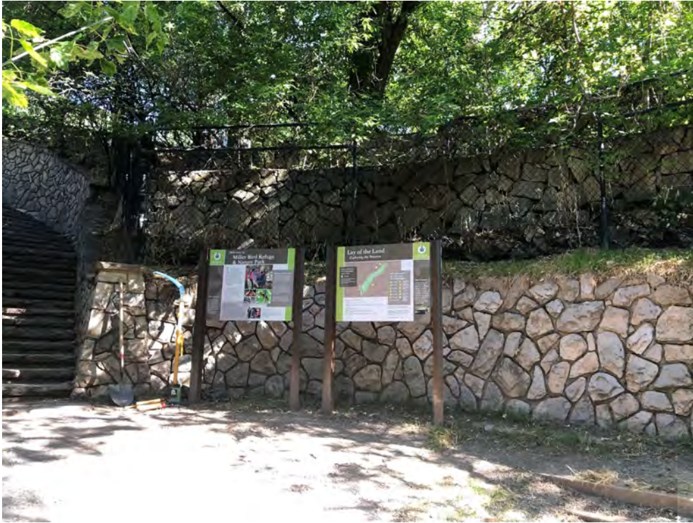
Photograph 3 - Retained slope constructed above the top of the rock wall.