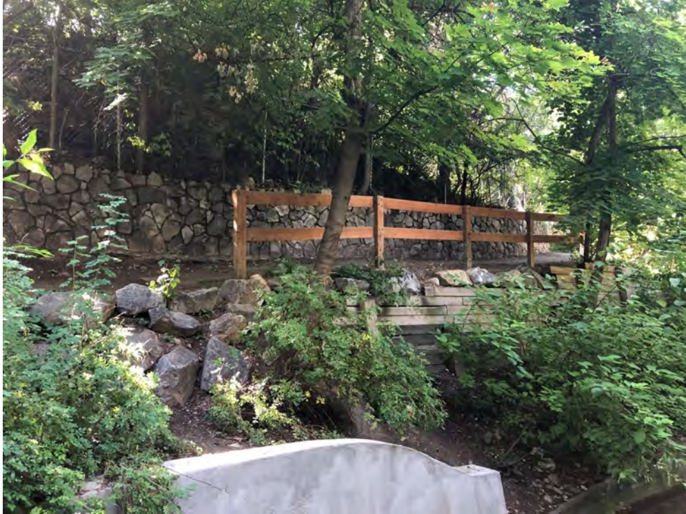
Photograph 9 - Newer timbers added to the top of the older timber retaining wall.