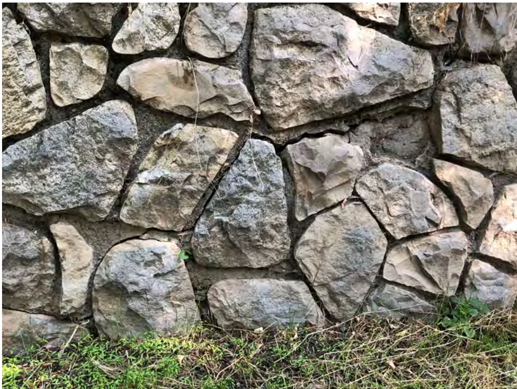
Photograph 2 - Cracks in lower-tier wall near north park entrance at 900 South.