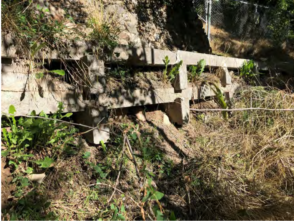
Photograph 7 - Crib wall on west side of creek has experienced erosion and undercutting.