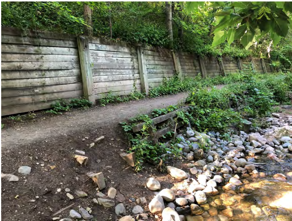
Photograph 10 - Crib wall on east side in poor condition. Timber wall above appears bulging or rotating.