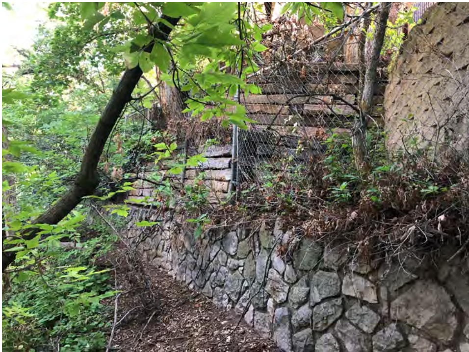
Photograph 14 - Structures encroaching near the top of the rock wall on the east side of the creek.