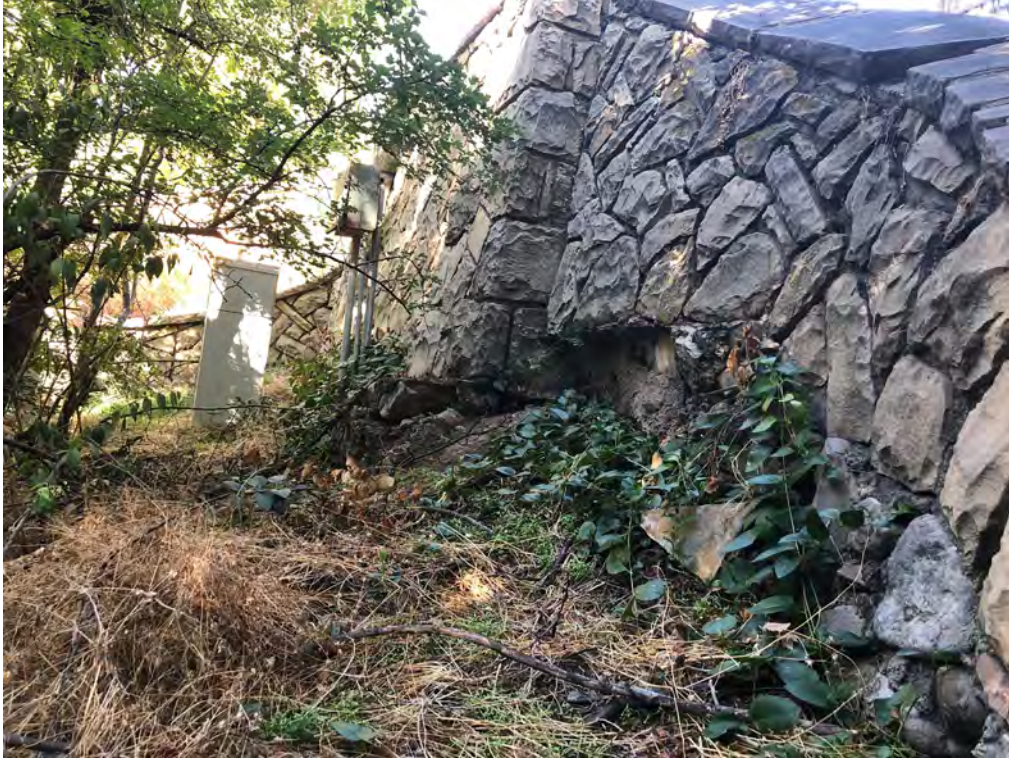
Photograph 1 - Undercut wall near the north park entrance at 900 South.