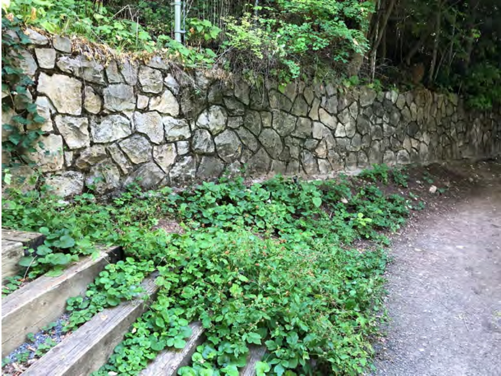
Photograph 5 - Ground below the rock wall has been lowered.