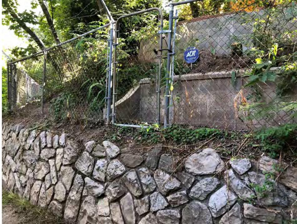
Photograph 15 - Structures encroaching near the tip of the rock wall on the east side of the creek.