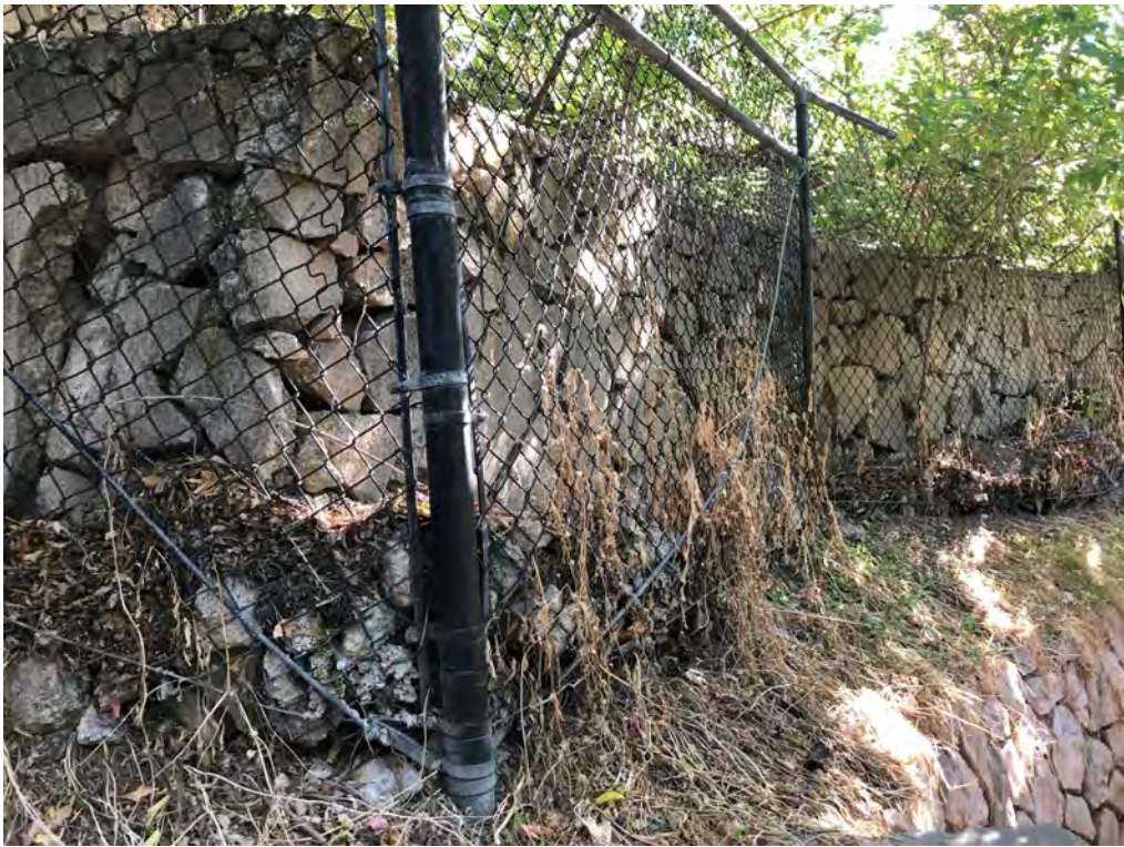
Photograph 4 - Retained slope constructed above the top of the rock wall.