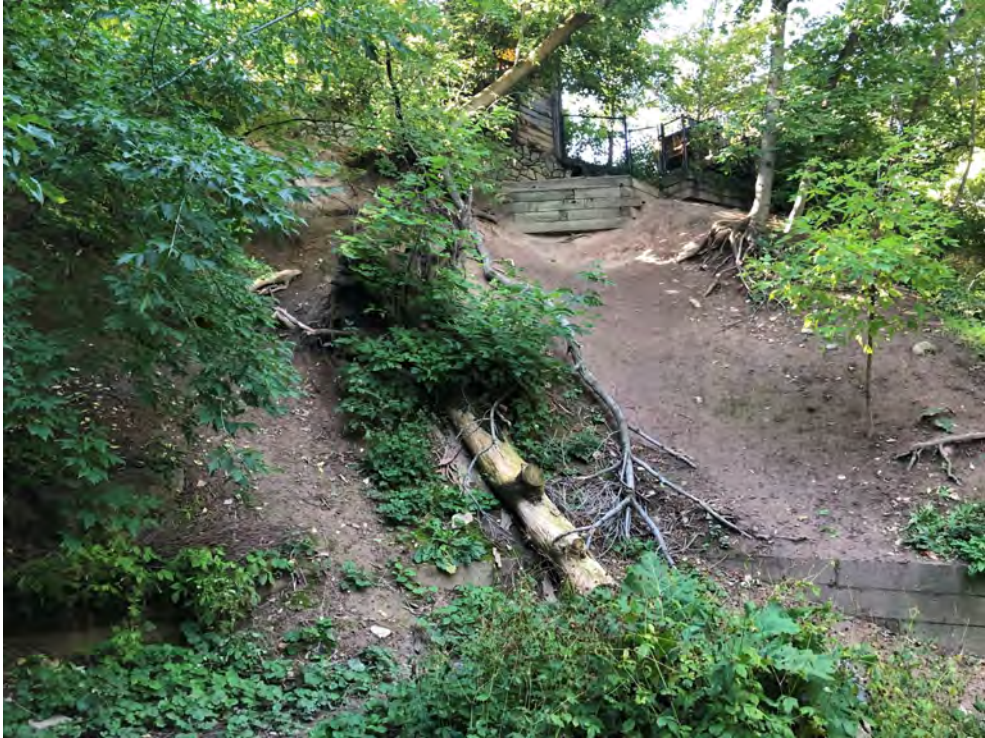
Photograph 11 - Area of erosion above the trail on the east side of the creek. The rock wall is seen near the top of the photo, above the area of erosion.