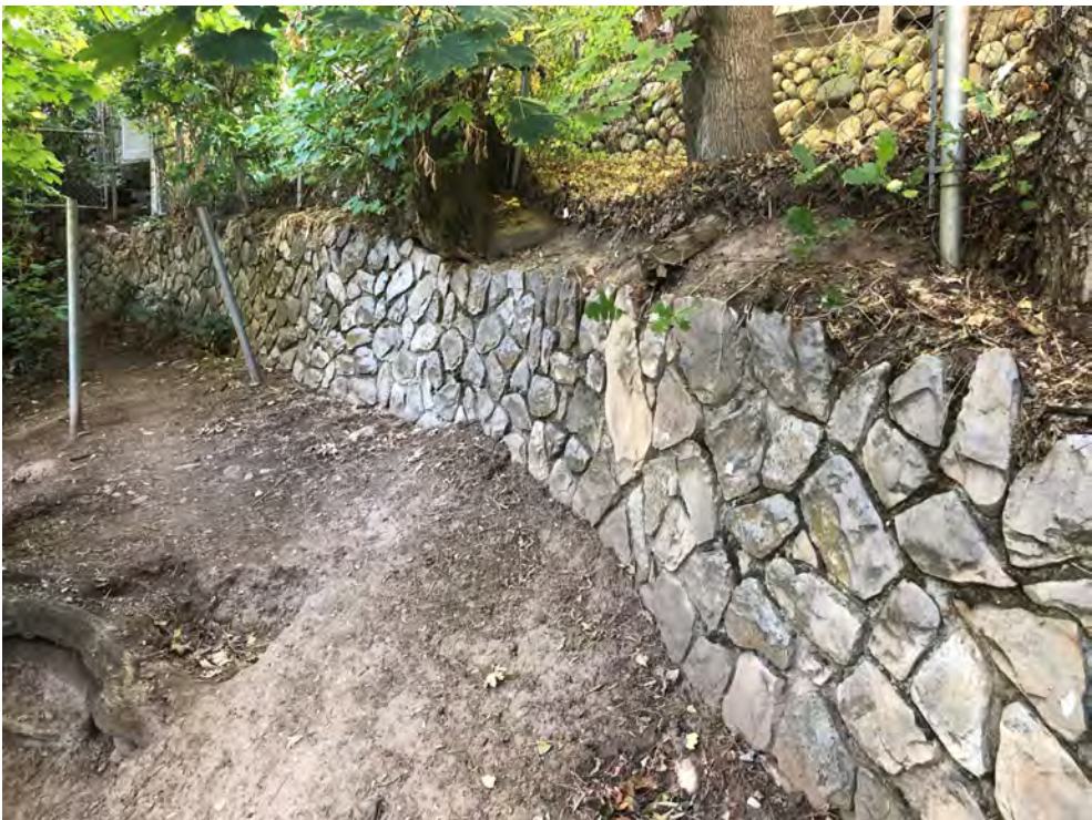
Photograph 12 - Rock wall above the area of erosion. Note trees and other loads near the top of the wall.