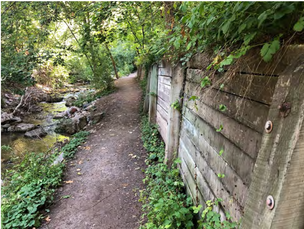
Photograph 8 - Timber wall section appears to have rotated away from slope.